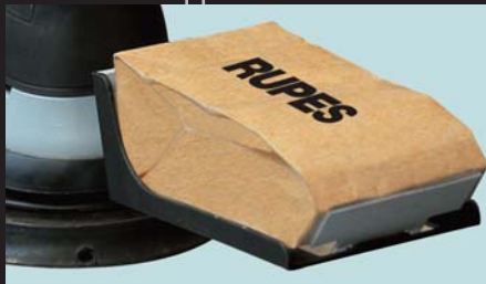
ECOFILTER cod. 993.002/5