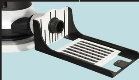
HOLDER FOR ECOFILTER cod. 993.001